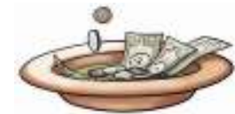
HSDAC YTD & MTD GIVING July 1—February 9

QUOTE OF THE WEEK They are like a man building a house, who dug down deep and laid the foundation on rock. When a flood came, the torrent struck that house but could not shake it, because it was well built. Luke 6:47-48 NIV