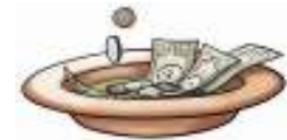
HSDAC YTD & MTD GIVING July 1—January 31

When you help someone out, don't think about how it looks. Just do it — quietly and unobtrusively. That is the way your God, who conceived you in love, working behind the scenes, helps you out. Matthew 6:3,4 — The Message